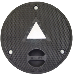
Built-in side handle on 18" models - one hand opening and positioning

■ City of LA Approval BR800075 A0721-001ID, A0721-008CEID A0721-101ID, A0721-108ID